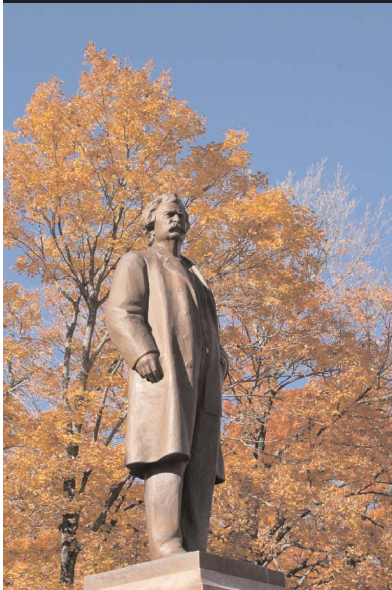
As showy as Autumn's maples but more enduring, Mark Twain looks out over his beloved Mississippi River from Hannibal's Riverview Park.